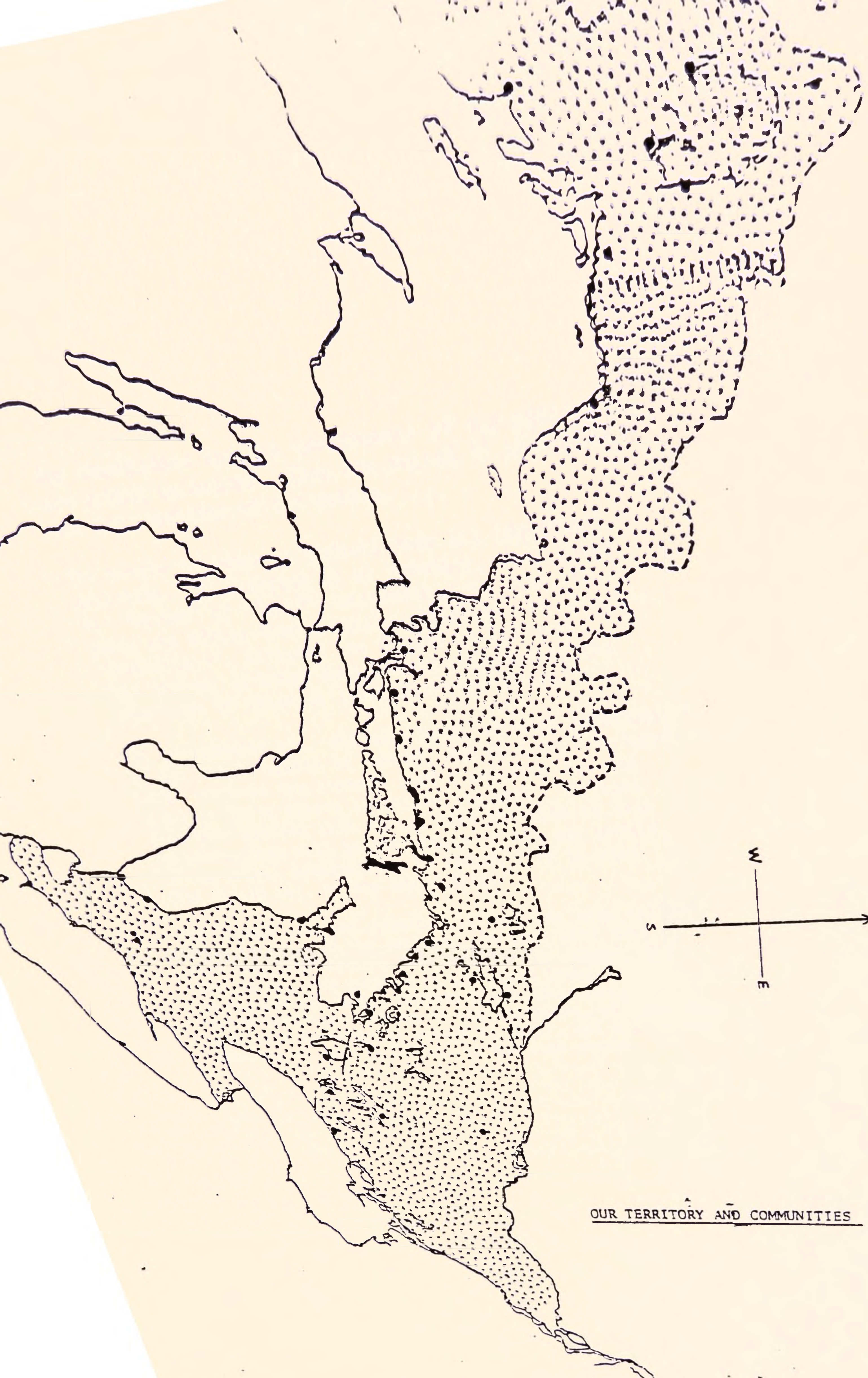
OUR TERRITORY AND COMMUNITIES