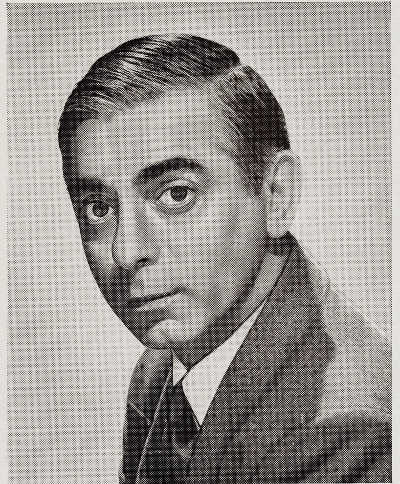
EDDIE CANTOR . . . Jew