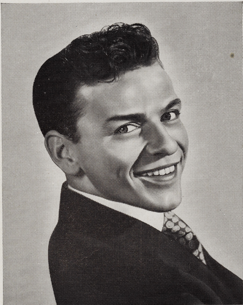
FRANK SINATRA . . . Immigrant's Son