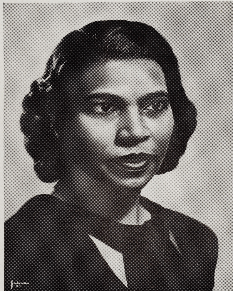
MARIAN ANDERSON . . . Negro