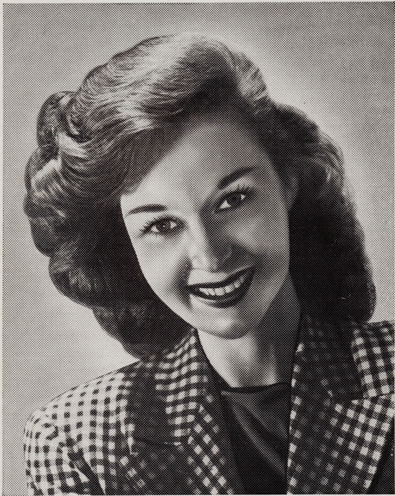
SUSAN HAYWARD . . . Protestant