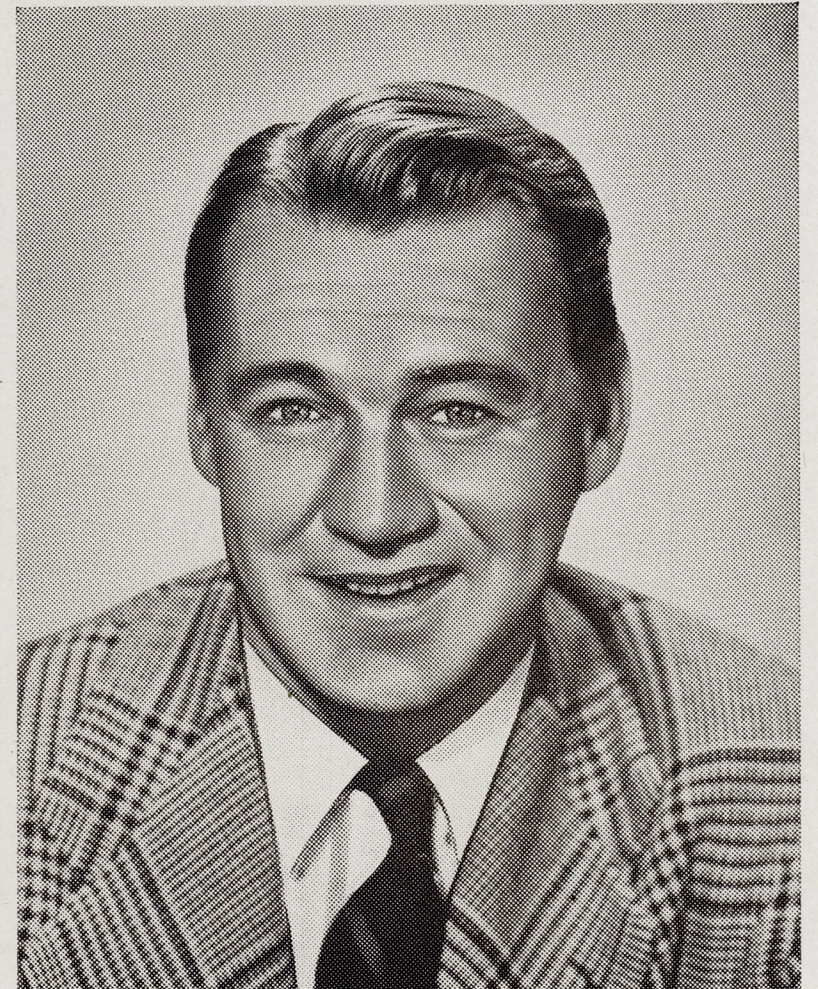
SONNY TUFTS . . . Mayflower Descendant